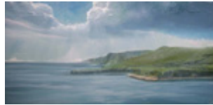
Kimmeridge

I am currently working towards another series of seascapes that explore paint and the act of painting as a process. Through these processes and certain techniques I hope to capture the power and atmosphere of the sea as well as develop, using paint, the relationship the land, the sea and the sky has with one another. As usual I have