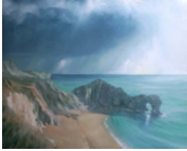
Durdle Door