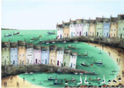
Rebecca Lardner - Coastal Curves

As the seasons change and we move from the beautiful autumn sunshine to the cooler days of winter, thoughts turn to Christmas - full of excitement, colour, hustle and bustle! The gallery has been busy over the last few months and we're now preparing for the Christmas Season - always with our customers in mind!