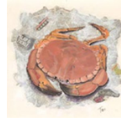
Big Nipper © Tracy McKenna

Tracy's work is quite distinctive, almost graphical in style with an element of fun.