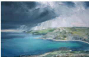
Chapman's Pool

"My interest in the natural coastline and the relationship between the sky, sea and land has been a prominent part of my work for the last 3 years. I have explored this subject through painting with many techniques of layering, using mixed media and developing a paint process. Before working with oils I used watercolour but I felt this could not capture the overbearing atmosphere of this subject.