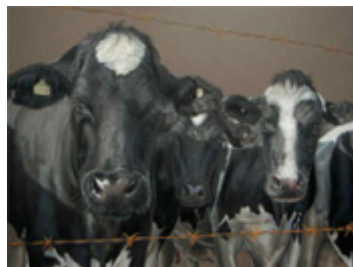
Down to the Wire