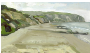
Swanage Beach ©Ben Spurling

offers a variety of interpretations of the coastal landscape from popular local artists Ben Spurling and Jane Colquhoun and our new